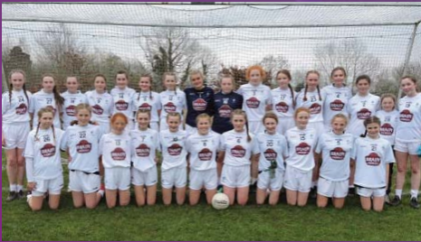
Kildare Ladies U14 Team