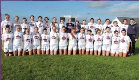
Kildare Ladies Minor Team