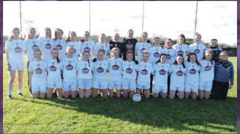
Kildare Ladies Senior Team