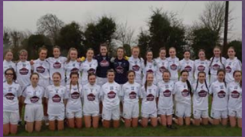
Kildare Ladies U16 Team