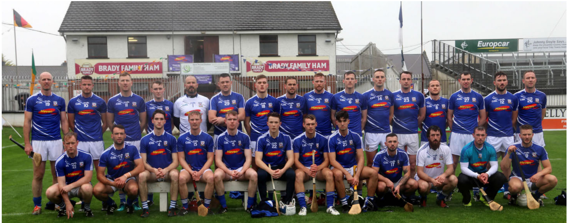
HAVEN HIRE SENIOR HURLING CHAMPIONS 2018