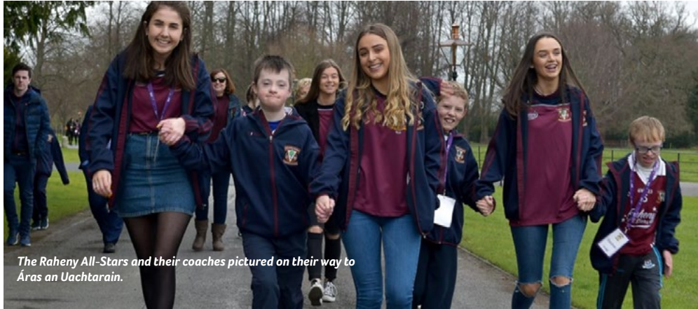
The Raheny All-Stars and their coaches pictured on their way to Aras an Uachtarain.