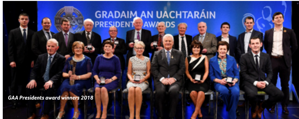
Buaiteoirí Gradaim an Uachtaráin 2018