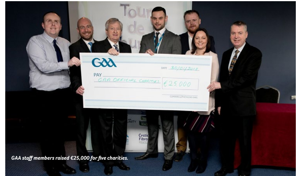
GAA staff members raised €25,000 for five charities.

Managing this national event took an exceptional collective team effort in terms of event preparation. This is an important point to note, as it shows the level of openness, encouragement and help that exists within the GAA and Croke Park staff body. Logistically it was challenging but, all in all, - it was a roaring success. The committee's main objectives were to ensure that everyone was safe and comfortable along the way - and