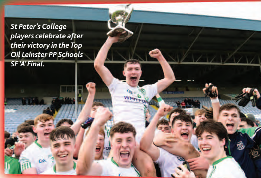
St Peter's College players celebrate after their victory in the Top Oil Leinster PP Schools SF 'A' Final.

St Kieran's College and CBS Kilkenny contested the Senior 'A' Hurling final again, with the reigning champions triumphing after a superb contest, by 1-14 to 0-13.