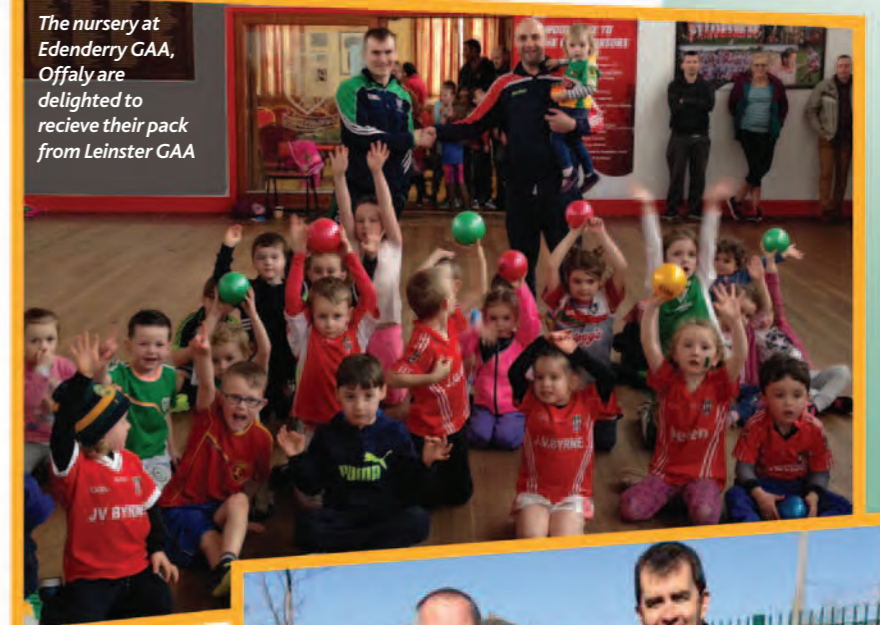
The nursery at Edenderry GAA, Offaly are delighted to receive their pack from Leinster GAA