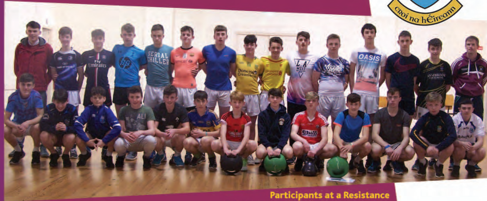
Participants at a Resistance Training session in Mercy SS Kilbeggan

At the start of the current academic year, Westmeath set about putting a programme in place whereby underage players could attend resistance training sessions through their post primary school.